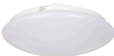
EMSHELL / EMSHELLS - Sensor