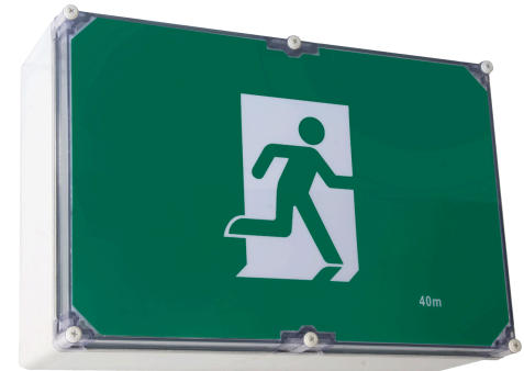
EXJUMBO40MWP / EXJUMBO40MWPRB - Freezer

LED Weatherproof Wall Mount Jumbo Exit IP67