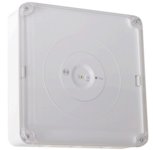
EMD80WP/EMD80WPRB - Freezer

LED Surface Mount Weatherproof Emergency D80 IP65