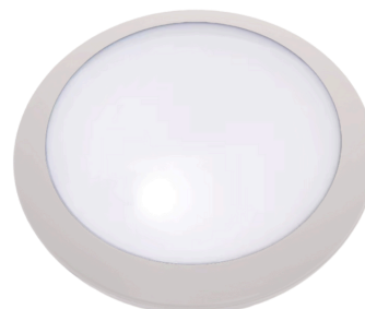
EMSHELLWP / EMSHELLWPS - Sensor