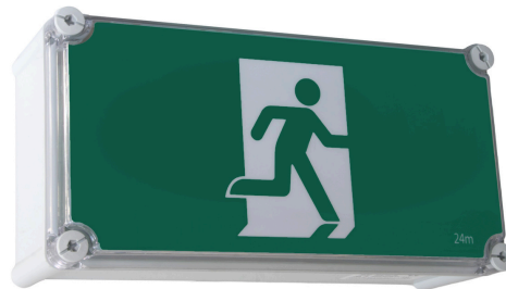
EXBOXWPL/ EXBOXWPLRB - Freezer