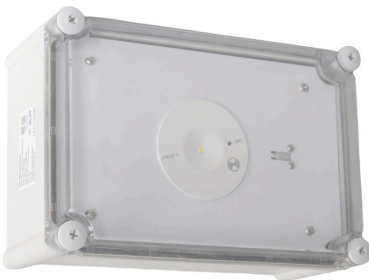
EMLITELWP/ EMLITELWPRB - Freezer

LED Surface Mount Weatherproof Emergency D40 IP65